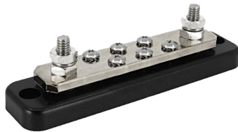
Busbar 250 A 2P with 6 screws