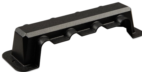
Cover for busbar 250 A with 12 screws