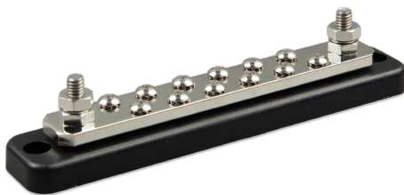
Busbar 250 A 2P with 12 screws